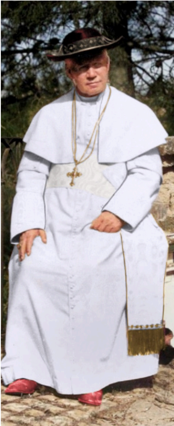
*Quam Singulari, Pope Saint Pius X, 1910

We begin this booklet with a brief Church history lesson that will demonstrate how children's prayers, especially prayers offered before Jesus in the Most Blessed Sacrament, were a "spiritual nuclear bomb" against the forces of evil. We can then ask ourselves: could bringing our children before Jesus in the Most Blessed Sacrament through Guided Eucharistic Holy Hours be a remedy to combat so many of the evils we face?